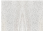
3cm Opal White Calcite | Bookmatch Rendering