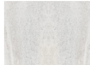
3cm Opal White Calcite | Bookmatch Rendering