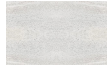
3cm Opal White Calcite | Quadmatch Rendering