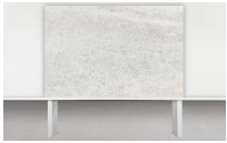
3cm Opal White Calcite | Full Slab Wall View

Aria Stone Gallery's Opal White Calcite features a crystal-like surface with neutral tones throughout the slab for a unique addition to your countertops or showers.